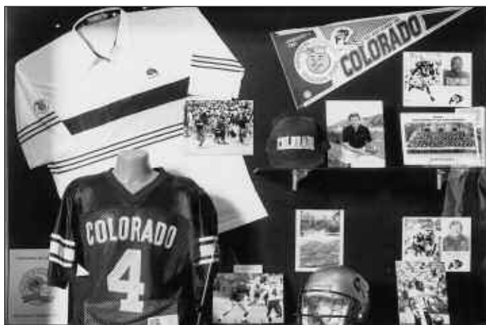
CU's National Title Display at the College Hall of Fame